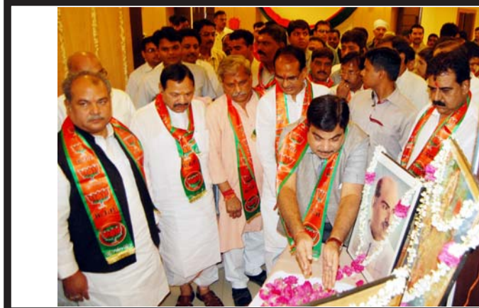
BJP National President Shri Nitin Gadkari flanked by BJP National General Secretary Shri Narendra Singh Tomar, MP CM Shri Shivraj Singh Chouhan, Madhya Pradesh BJP President Shri Prabhat Jha paying floral tribute to Dr. Shyama Prasad Mookerjee at Indore (MP).