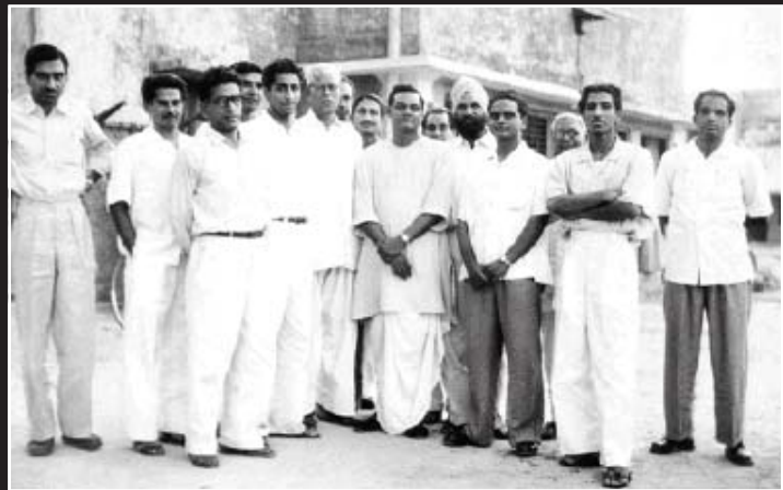
Shri Atal Bihari Vajpayee along with other Jansangh leaders.