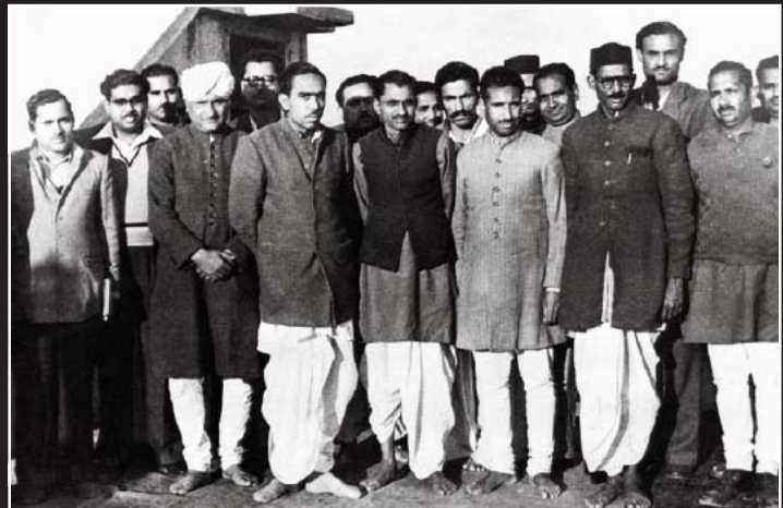
Pt. Deendayal Upadhyay alongwith other Janasangh leaders