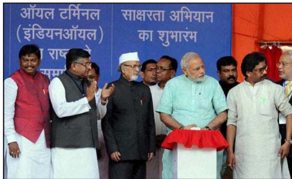
PM launches various development projects in Jharkhand, talks about balanced growth across all parts of India.