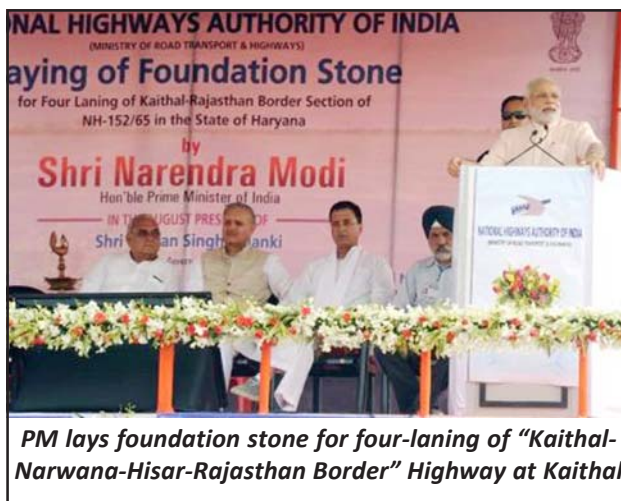
PM lays foundation stone for four-laning of “Kaithal-Narwana-Hisar-Rajasthan Border” Highway at Kaithal

for adoption of modern agricultural practices and technologies, which not only help in filling granaries, but also ensure that the farmer gets well-remunerated. ( Ann ka bhandar bhi