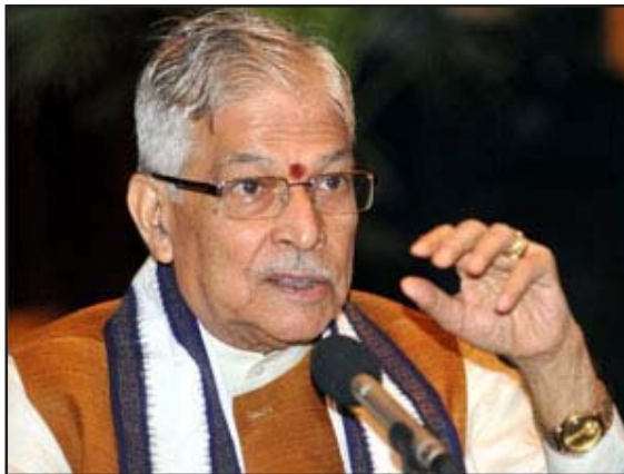
Synopsis of the speech delivered by Former BJP National President Dr. Murlimanohar Joshi in Lok Sabha on Food Security Bill on August 26, 2013.

The Government of Chhattisgarh is giving food security to 90 per cent population. Pandit Jawaharlal Nehru once said "Everything else can wait but not agriculture" but it seems that the Government did not pay any attention to that. This Bill provides for giving hot cooked meal to