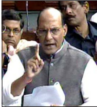
Synopsis of the speech delivered by BJP National President Shri Rajnath Singh on August 29, 2013 while initiating the discussion on Land Acquisition Bill.

lost its original objective. We cannot link land with economic activities alone, farmers are emotionally and culturally attached to it. The manner in which there has been indiscriminate acquisition of land in the name of economic development pre and post Independence has created resentment among the farmers. Land acquisition has led to displacement of about 6.5 crore farmers. This Bill has been amended thrice i.e. in 1962, 1967 and 1984 since 1894. The farmers are of the view that their land should be acquired in such a manner that it should not create any crisis for their family in future. The Government should pay attention towards this. Despite the above amendments the farmers of the country did not get any relief. This Bill finds a way out for acquisition of land for private sector through inclusion of the term 'public purpose' in this Bill. A long list of public purposes has been appended to this Bill which includes infrastructure also. This term is so omprehensive