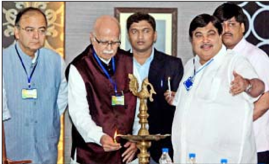
Political resolution passed by BJP National Office Bearers meeting in Kolkata on 15 February 2011

In fact even on that matter, the non-Congress States were far better in clamping down on