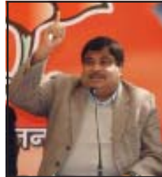
BJP National President's response to Prime Minister Manmohan Singh's Press Conference on February 16

the support of the Finance Minister. What support is there of the UPA and the Congress in this? This means everybody is responsible," Gadkari said. He insisted that as head of Group of Ministers, it was the Prime Minister's responsibility to check