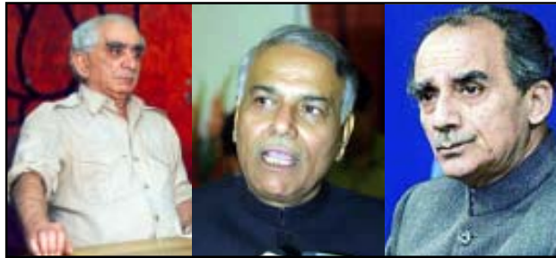
Press release on the Interim Budget issued by Shri Jaswant Singh, Shri Yashwant Sinha and Shri Arun Shourie on February 16 in New Delhi.

5. As for “focusing on agriculture, rural development and infrastructure” agricultural growth remained respectable only in the years in which there were good monsoons – far from ensuring the interests of the farmers, its policies have driven the farmers to suicide; in the 47 days of 2009 alone, there have been