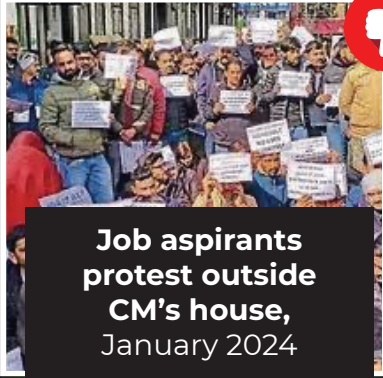
Job aspirants protest outside CM's house, January 2024