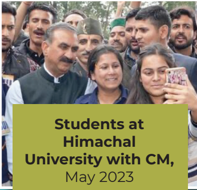
Students at Himachal University with CM, May 2023